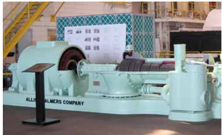
Above is a photograph of one of the earliest A-C turbine-generators, which was recently restored and sectioned for display by ReGENco.

ReGENco's principal business is providing restoration services to power generation clients for steam and combustion turbines and their associated electrical generators. ReGENco's unique capabilities, however, make them an ideal vendor for the repair and restoration of significant mechanical artifacts. ReGENco currently occupies the famous Allis-Chalmers main erection bay where all A-C steam & hydroelectric turbines were manufactured. Allis-Chalmers built over 5,000 steam turbine-generators at this location between 1904 and 1962, many of which are still active in power generation today.