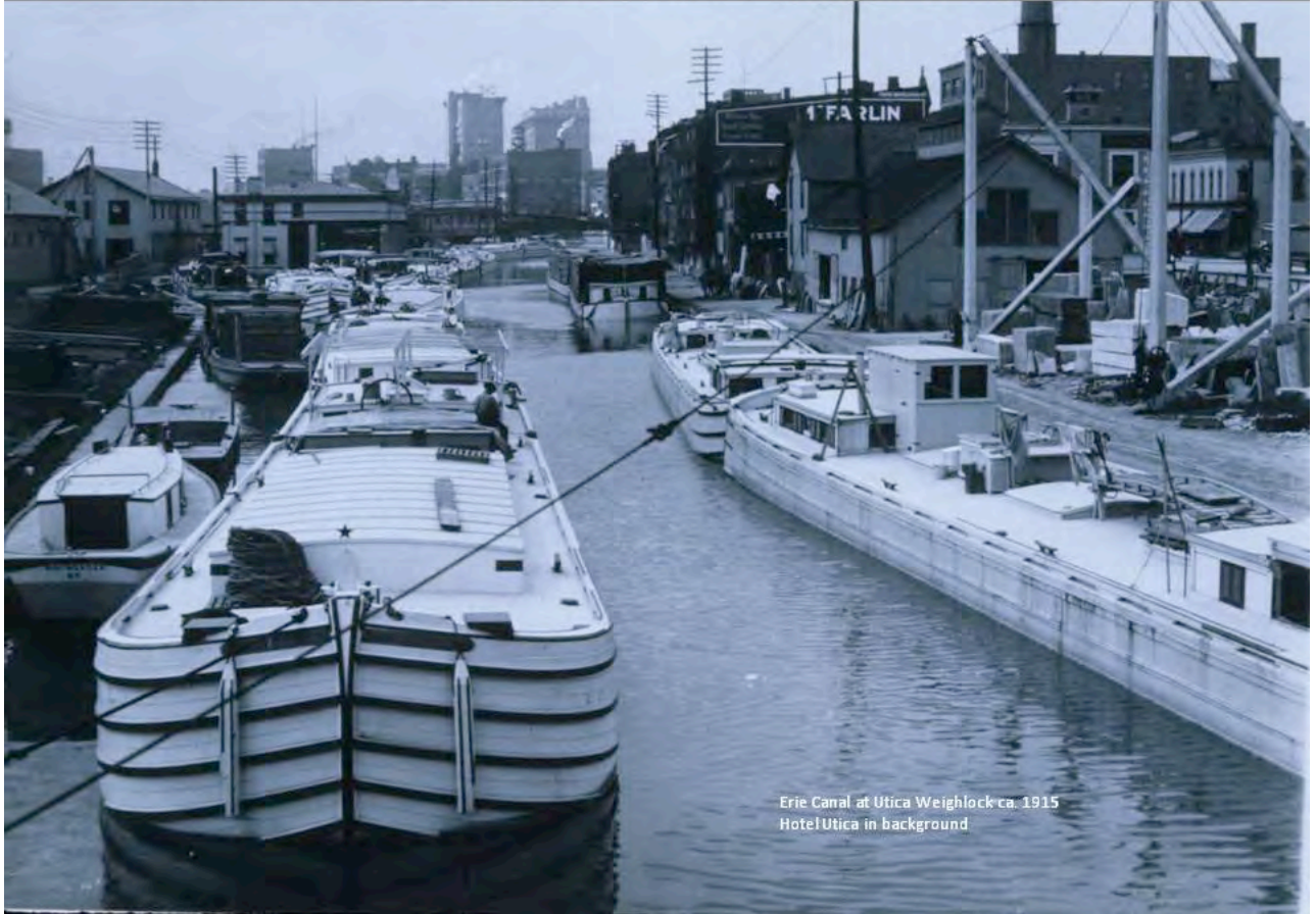
Erie Canal at Utica Weighlock ca. 1915 Hotel Utica in background